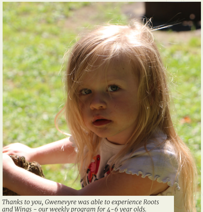
Thanks to you, Gwenevyre was able to experience Roots and Wings - our weekly program for 4-6 year olds.